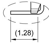
Detail "A" Side Joint Length